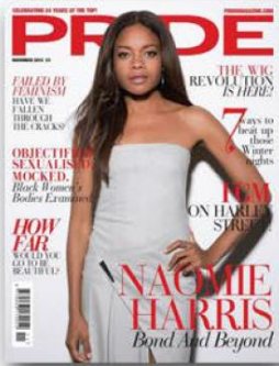
PRIDE NOV 2015