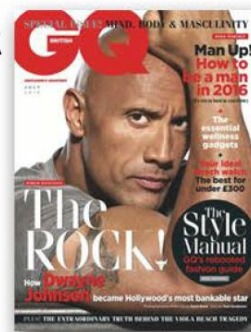
GQ JULY 2016

How to use: Compare and contrast Pride and GQ. Use this Knowledge Organiser to identify the similarities and differences between the two products.