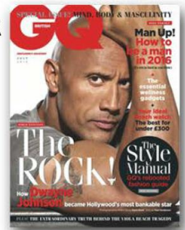
GQ JULY 2016

How to use: Compare and contrast Pride and GQ. Use this Knowledge Organiser to identify the similarities and differences between the two products.