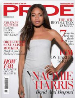
PRIDE NOV 2015